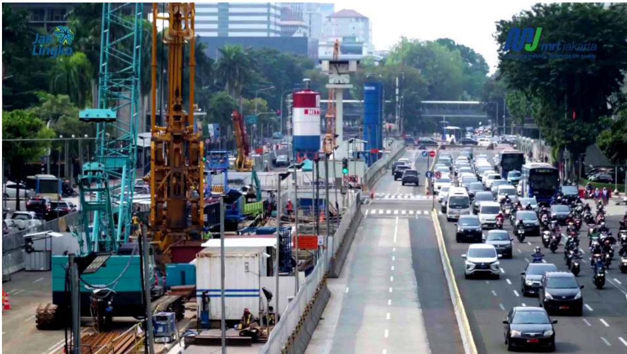
Caption: Phase II of the project continues the north-south corridor railway line from the Bundaran HI Roundabout to West Ancol for a total of 11.8 kilometers.