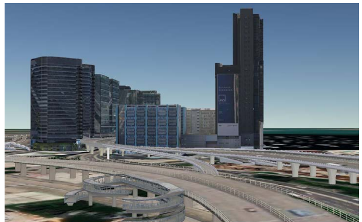
Bentley’s advanced modeling applications automated and streamlined data workflows, saving 20% in processing time.