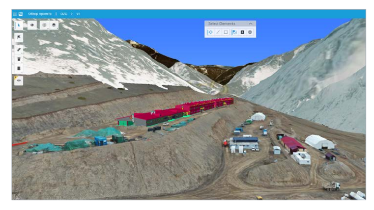
Leveraging ProjectWise and Bentley's digital twin technology optimized collaboration and scheduling across 500 work sites.

In addition, due to the large amount of water in the mountains, AAEngineering had to model a drainage channel to drain water and bypass the tailings dump. PLAXIS provided the geotechnical analysis that was necessary for them to optimize design of the drainage network and ensure stability of the tailings and storage pond dams. Throughout the design process, all stages of construction were controlled by iTwin Capture and SYNCHRO, enabling construction simulation and virtual planning that allowed