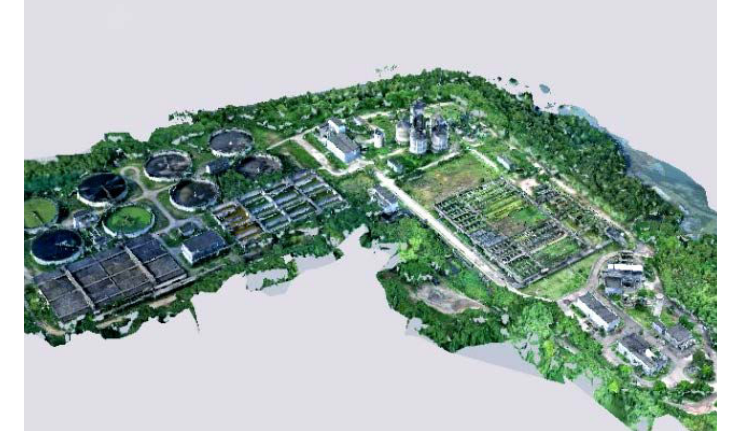
Leveraging ContextCapture, Aegea processed 156,000 drone-captured photos in record time, generating 3D digital twins.