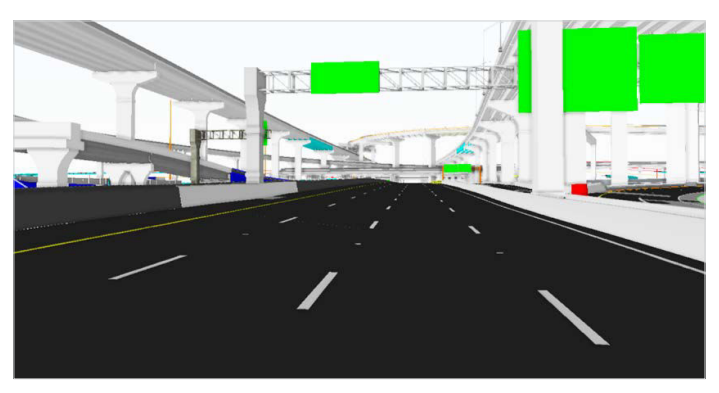
Digital design helped the team determine how to reduce the use of expensive elements like steel spans while keeping the design strong.

Bentleu<sup>®</sup> FIND OUT MORE AT BENTLEY.COM