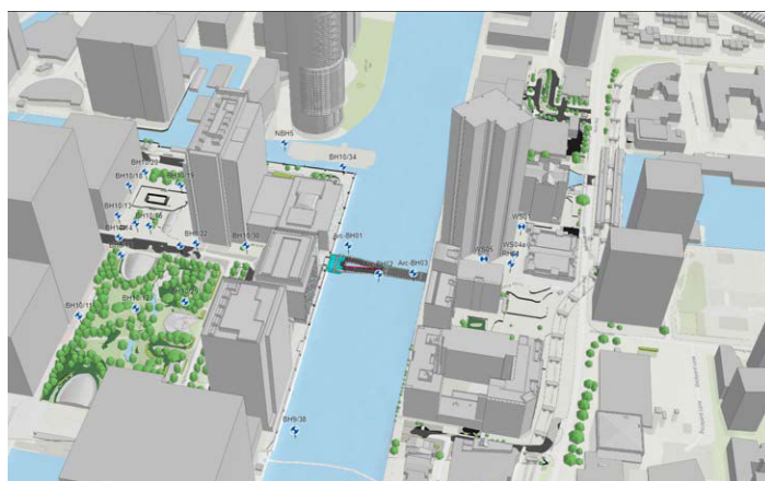
The South Dock Bridge provided a unique opportunity to showcase Arcadis' innovative digital design capabilities, together with Bentley and Seequent software. Image courtesy of Knight Architects.

The digital model allowed the Arcadis team to estimate dredging volumes and create geological cross sections for the foundation's spatial layout, while detailed design and back analyses for the existing quay walls were performed with PLAXIS and GeoStudio. “We incorporated the location of the submerged obstructions found at the dock's bottom into the Leapfrog ground model, which helped to determine the best spots for the bridge's piled foundations and reduce construction risks,” said Gillarduzzi. 3D subsurface modeling with Leapfrog was key for verifying the project's buildability, addressing the