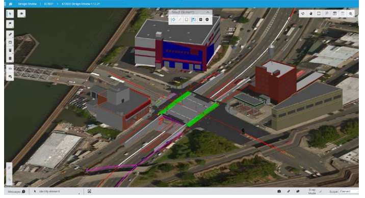
Using iTwin Design Review provided an integrated digital environment for more than 180 reviewers across 15 agencies to optimize design review and change management.

Bentley applications, NYSDOT selected OpenBridge Modeler, ProSteel, and MicroStation to develop a 3D model of the entire bridge structure to a level of detail that contractually enabled the team to build directly from the model, without requiring the aid of a complete set of 2D plans. The interoperability of Bentley's modeling software enabled NYSDOT to directly reference the highway designers' OpenRoads alignment file in the 3D bridge model, ensuring positional accuracy. Integrating iTwin Design Review to the project allowed more than 180 reviewers across 15 agencies to easily access and comment on the model in a digital environment.