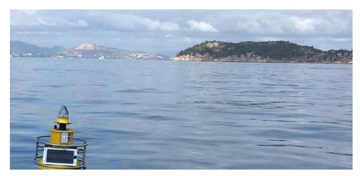
POTL Marine buoy with Xylem EXO and Gill Water Quality Sensors.