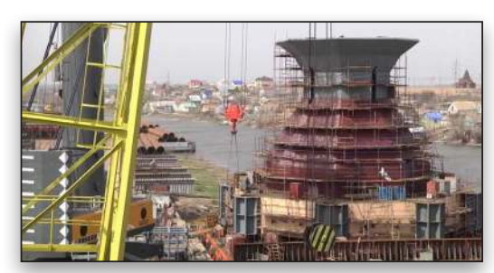
The risk of human errors and industrial accidents that could endanger workers during construction was reduced as a result of the accessibility to operational information.

data that provided information mobility for the client's multioffice design team. In addition to the as-built data model, Volgogradnefteproekt was also responsible for the technical design of a unit-conductor to be used for oil well drilling and extraction.