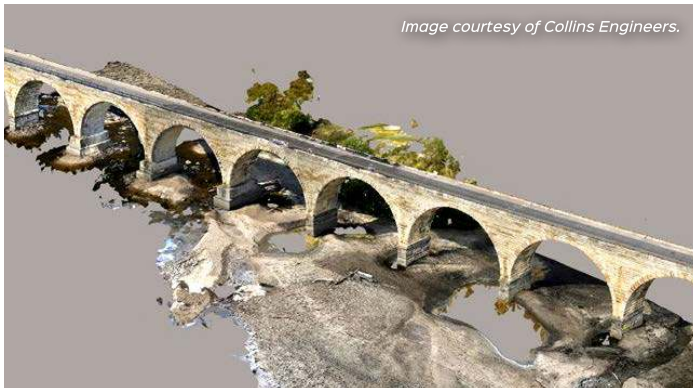
To preserve and improve the structural condition of an historical landmark, MnDOT initiated a USD 12 million rehabilitation of Minneapolis' 140-year-old Stone Arch Bridge.

access the digital twins via tablets and record their inspection information directly on the models. Traditionally, inspection notes were recorded and communicated using pencil and paper, accompanied by photos, that lacked the necessary detail to make definitive decisions that would help them both timely and safely complete the project. However, working with the 3D digital twin meant that the field team could inspect the bridge remotely, record their findings directly on it, and accurately pinpoint the areas in need of repair.