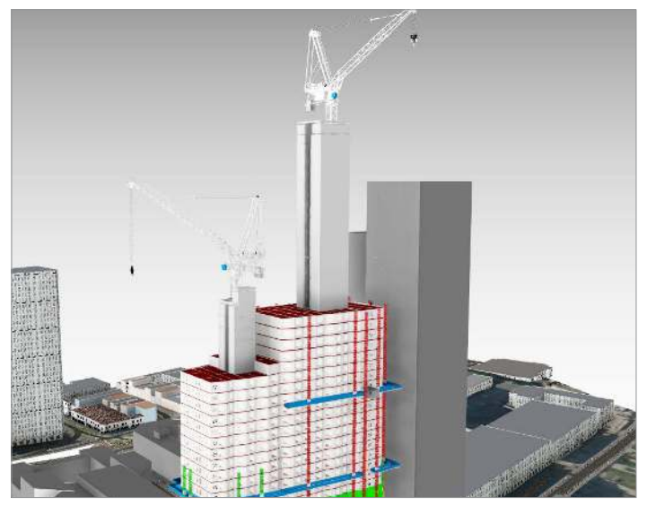
The team used SYNCHRO to create a 4D BIM model where they could visually demonstrate their plan to stakeholders.

"By using SYNCHRO on this project, we have identified and rectified several sequencing errors and have also been able to identify key areas where