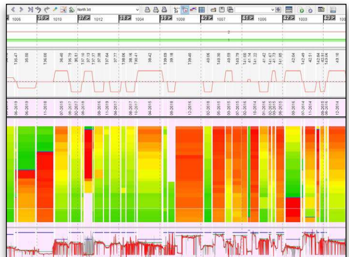
Analyze rail condition history and forecast rail maintenance.

Data visualization is critical in transforming vast quantities of complex linear data into actionable information that users can readily access, understand, and utilize. Straight line diagram visualization features provide you with instant access to an informative representation of any combination of configured data types at any location on the railroad network.