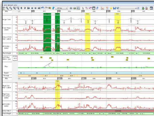
Manage rail asset information.